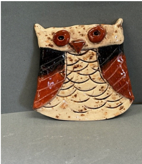
Reeves Beverly 3rd