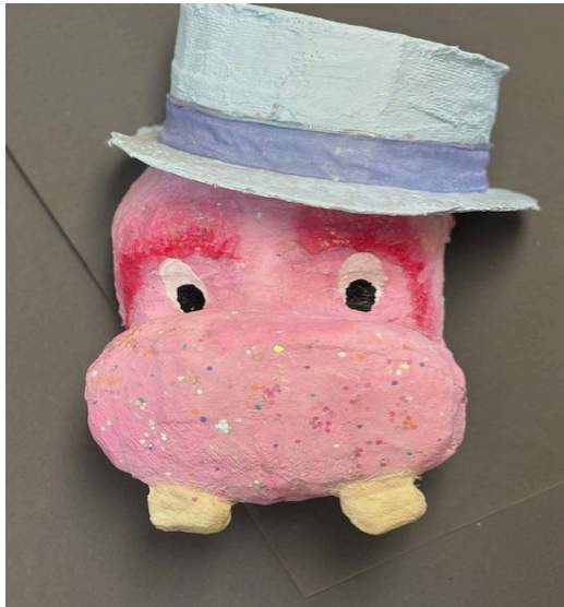
Stella Short 6th