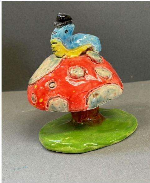
Shannan Hungerford 6TH