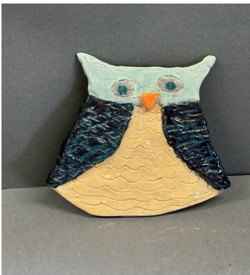
Adeline Turluck 3rd