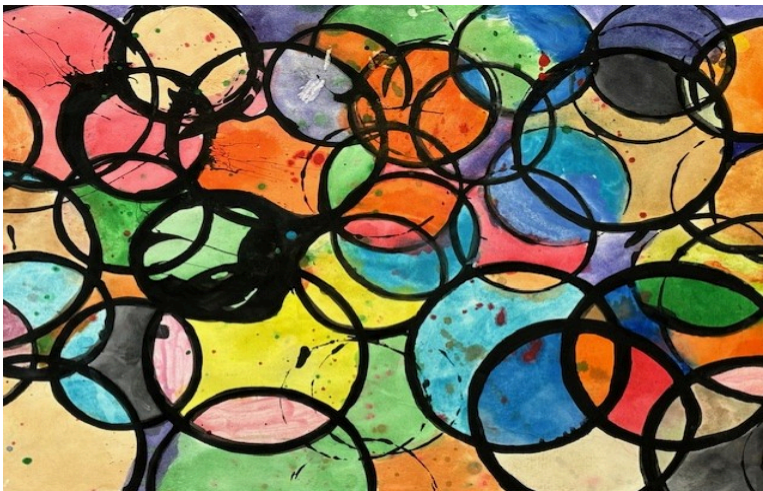
Zach Ard 3rd