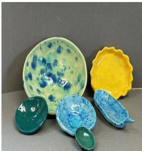
Bennett Burroughs 6th