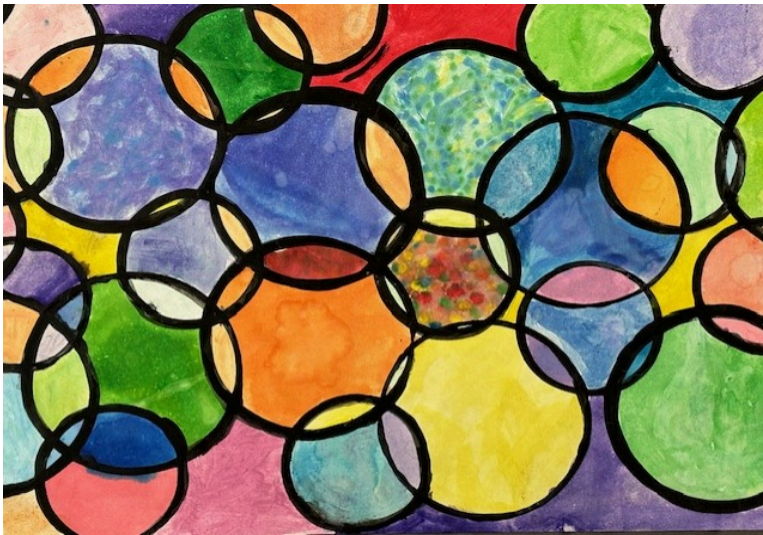
Turner Mesimer 3rd