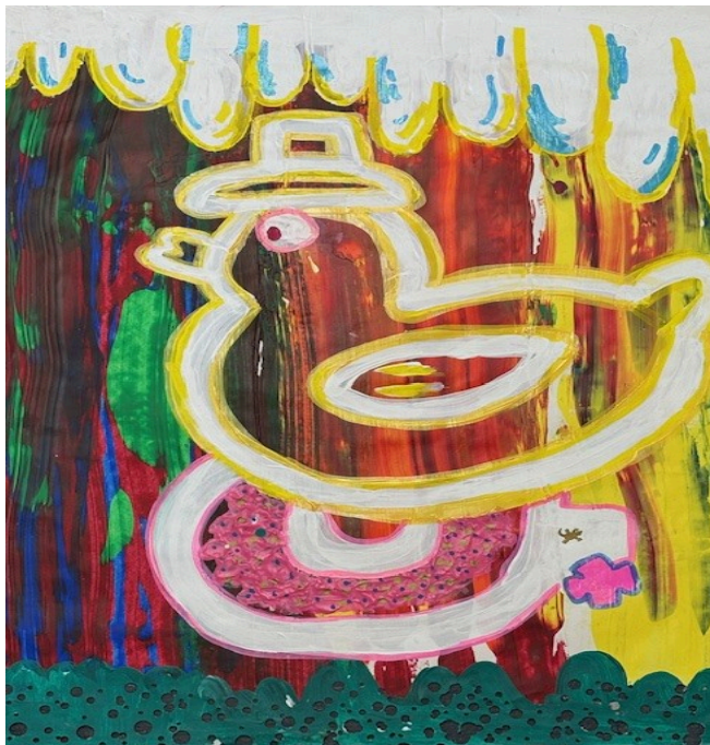
Wells Payne 5th