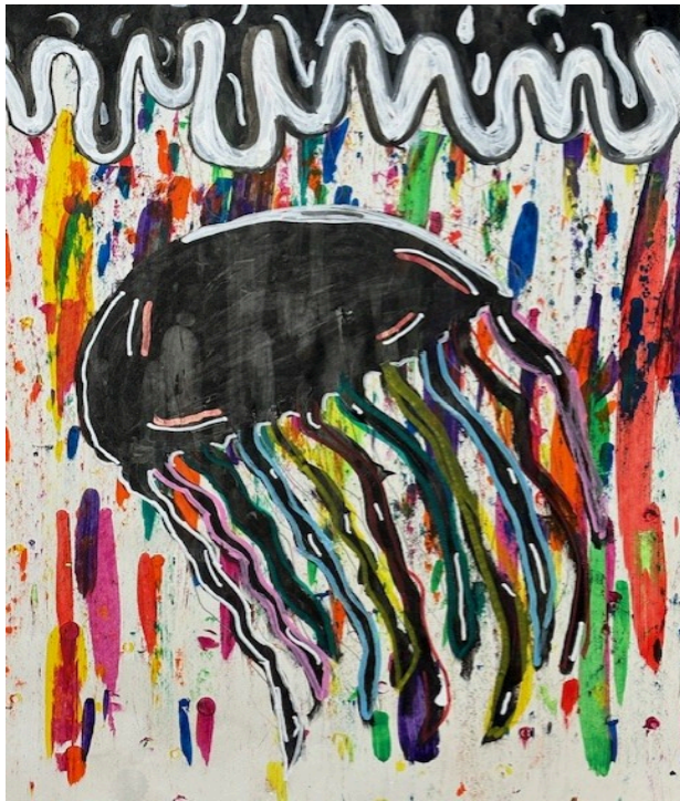
Annabelle Strong 5th

Once again, thank you for sharing your talented students with me. It is a joy to teach them and see their creativity shine. We have used a lot of materials and art supplies this year. We create a lot of sculptures and ceramics, which does require a significant amount of materials. Thank you again for your support of the art program.