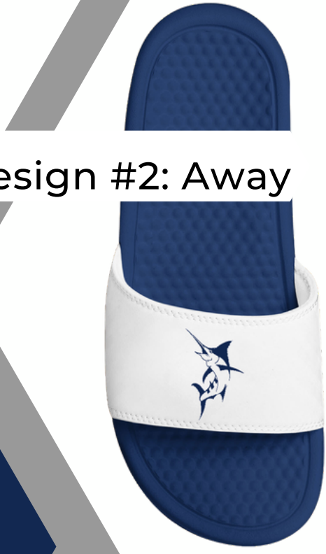
Design #2: Away