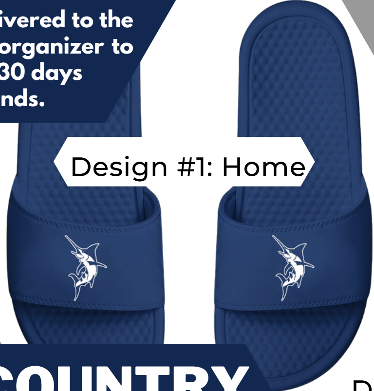
Design #1: Home