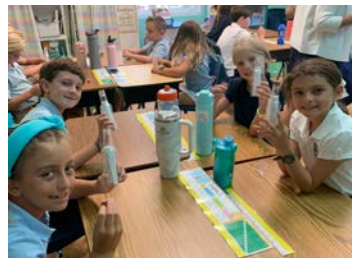
Students in third grade created their own messages in a bottle and added them to their bulletin board in the hallway!