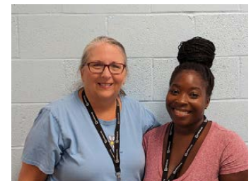
Aftercare is off to a great start...see next page for more details.