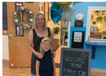
Welcome to all our new students! See next page to see who is new this year!