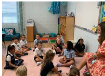
First grade had fun with math centers. See more on the next page.