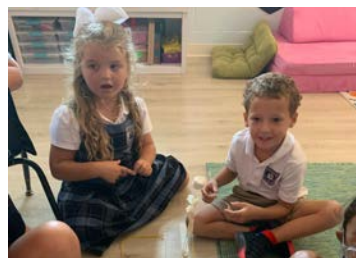
Students in Kindergarten and first grade took on the Marshmallow Challenge. See more on the next page.