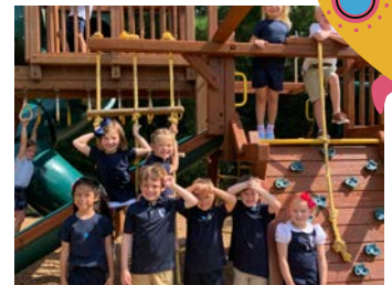
Students enjoyed recess when the weather permitted. If the heat index was too high, we held indoor recess.