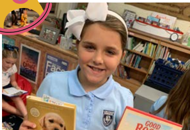
Students enjoyed attending their related arts classes this week. They had art, music, library, PE, and Spanish!