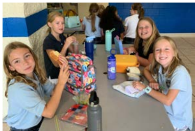
The students had fun connecting with their friends during lunchtime!